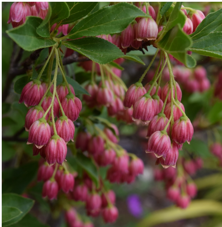
Left: Enkianthus is a shrub for part shade. Below: Peony Coral Charm