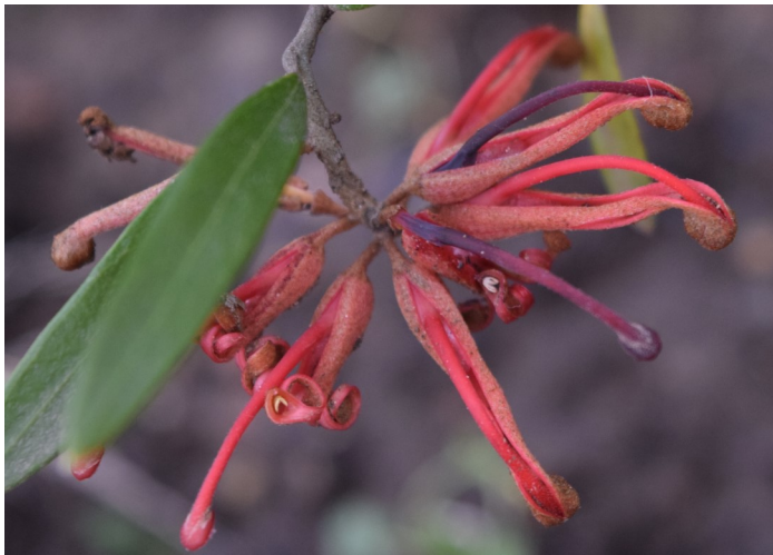
Above: Grevillea 'Neil Bell'