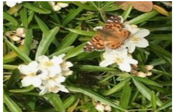
Right: Choisya x 'Aztec Pearl' (Mexican Orange) blooms a second time in fall