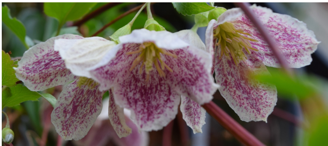
Winter-flowering evergreen Clematis cirrhosa 'Freckles'