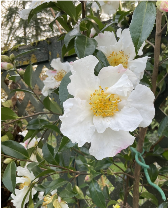
Left: Camellia sasanqua