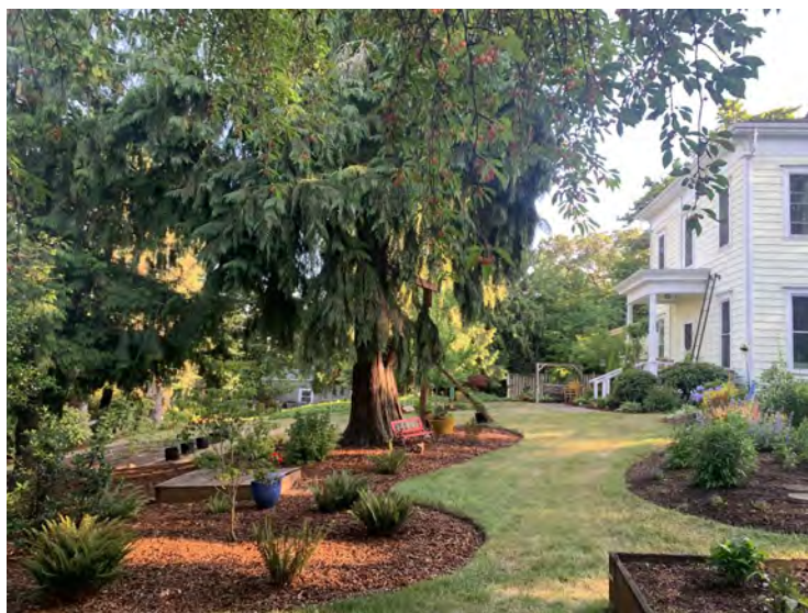
Colleen and Rob Schulze's garden and neighbor's garden—June 26 tour in Philomath.