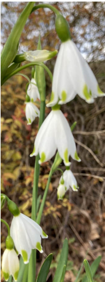
Leucojum (Summer snowflake)