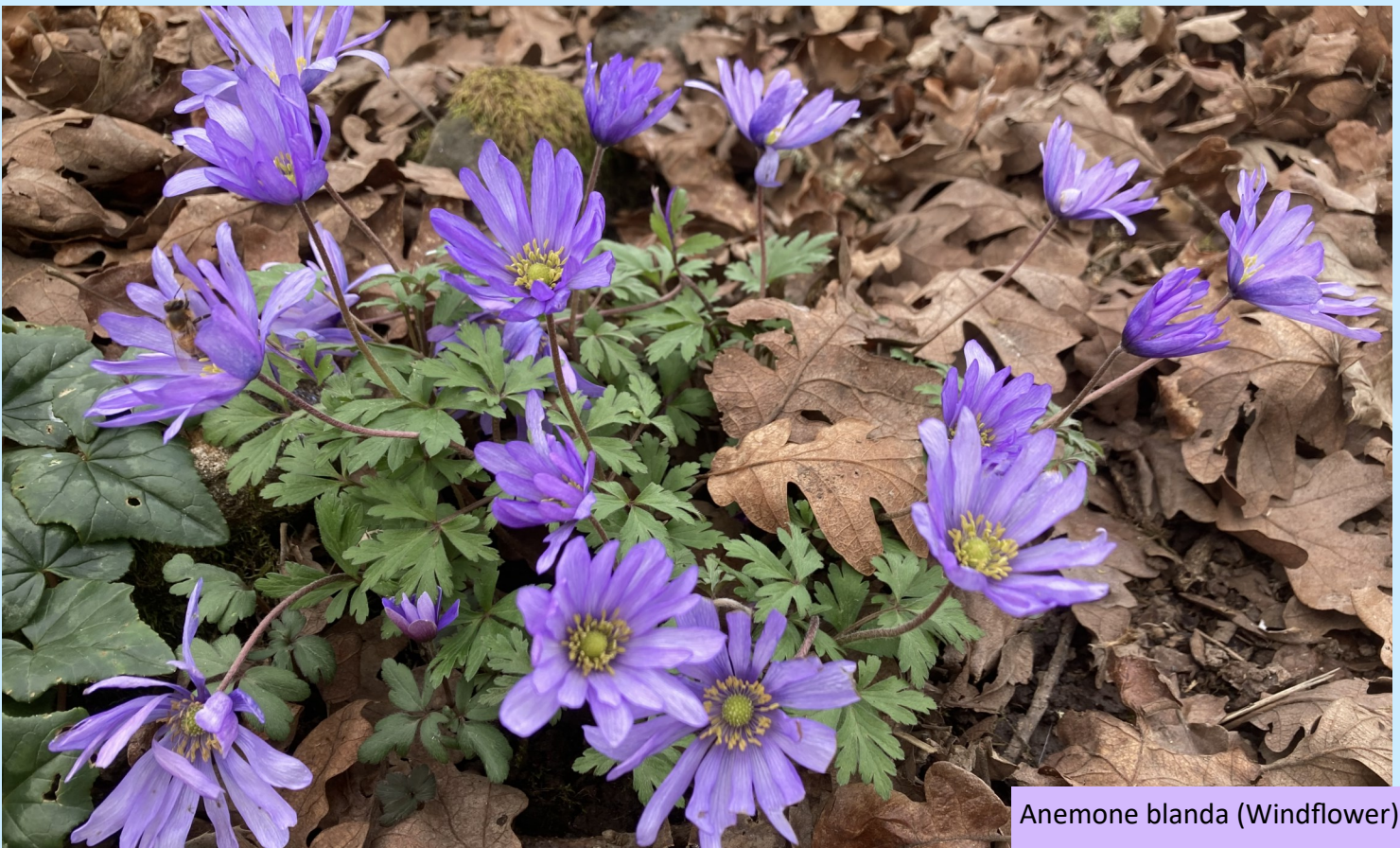
Anemone blanda (Windflower)