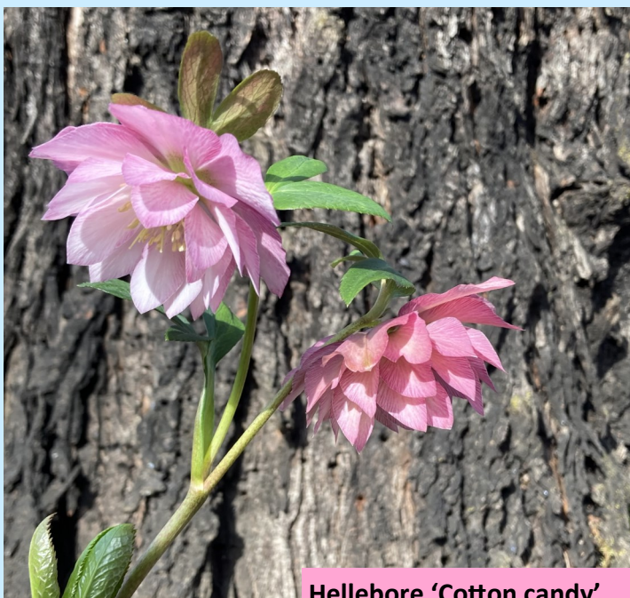
Hellebore 'Cotton candy'