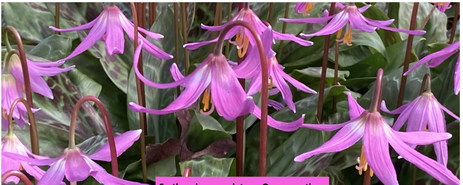
Erythronium revolutum: Oregon native