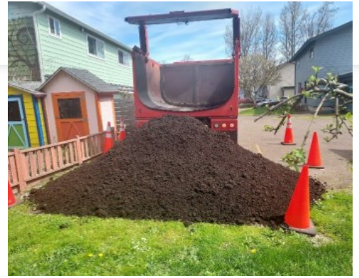
Soil delivered at Leonard Street garden