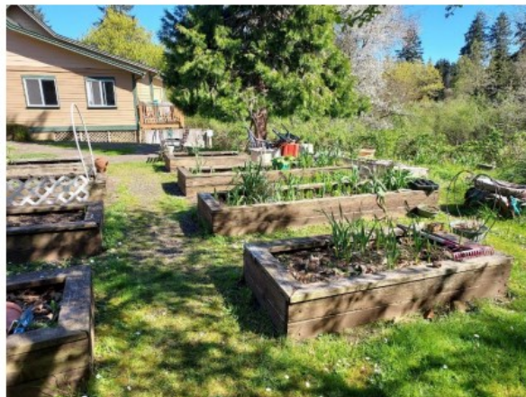
Gardens at Linnhaven