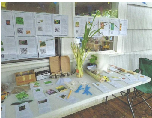
Seed starting stations with the educational materials developed by OSU Horticulture Club members ready for the start of the workshop.

Your support sprouted more than plants; it helped us cultivate a sense of community, shared knowledge and appreciation of diverse plant life that connects us all.