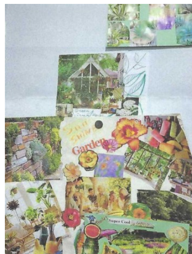
Visitors had an opportunity to create "Dream Garden" idea boards using old gardening magazines donated to the event.

With the support of local businesses and volunteers, a spread of flavorful treats allowed the visitors to taste herbs to help them choose which of them they would like to grow.